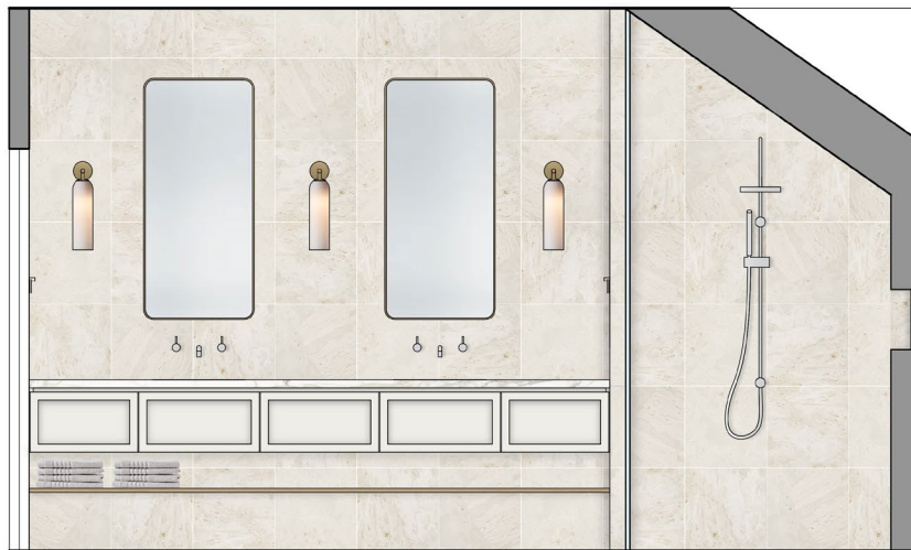
1 ENSUITE - ELEVATION A SCALE: 1:20

* Specific inclusions to be agreed in proposal.